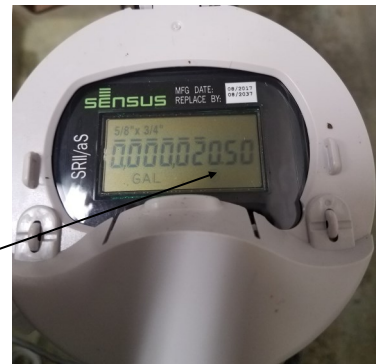
Digital Totalizing Meter

Totalizer advances for very low flow rates (less than 1/4 gallon per mi- nute). Open and close lid to display instantaneous flow rate (gallons per minute).